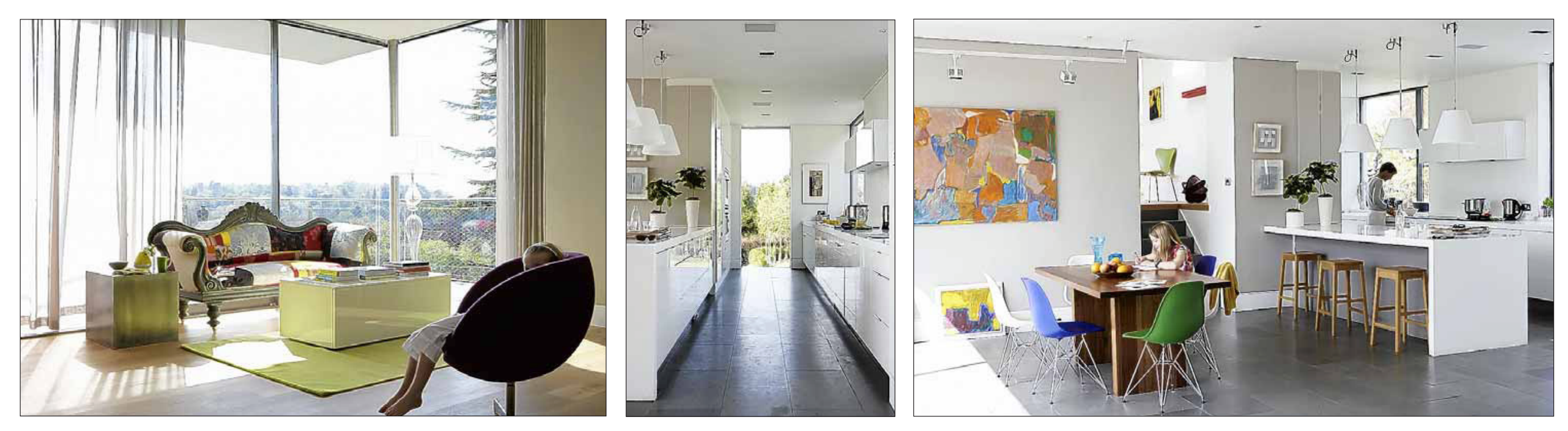
Clockwise from above: the elevated living room, with its own balcony, is borrowed from the original bungalow; the kitchen is where the family congregate, says Annabel Agace; the white décor in the family area is broken by a colourful painting; the kitchen is positioned so that the whole house can be seen from it